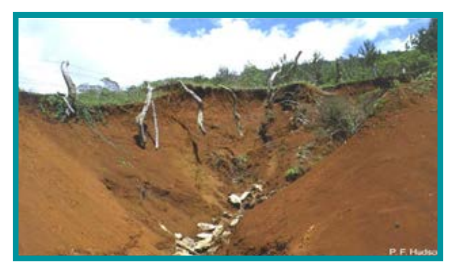
Figure 2. Highly degraded areas must be managed to minimise further degradation

Highly degraded sites must be identified and a management plan developed to minimise further degradation. For example, if a production site has severe soil erosion, planting grass on the headlands and installing cut-off drains and diversion banks will slow the water flow and divert water away from cultivated areas. Control measures should be monitored to check that further degradation is not occurring.