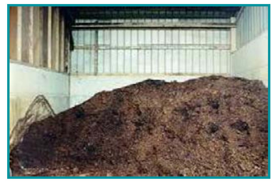
Figure 11. Offensive odours can be caused by animal manures, waste disposal sites for produce, composting sites and activities, and waste management equipment.

Another good practice is to dig the manure into the soil as quickly as possible. The best method is to incorporate it as it is put on, or to inject it. As with the storage area, natural and man-made barriers between production areas and neighbours can greatly reduce the likelihood of complaints. Apart from the visual effect, barriers can also help to filter and thin out odours.