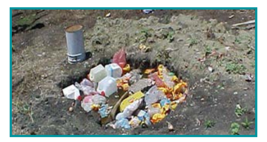
Figure 10. If disposing of waste materials on site, do not bury or dump materials close to waterways or where run-off or leaching from the materials can contaminate waterways or ground water.

Regular maintenance of vehicles and equipment ensures efficient operation and reduces energy use and costs.