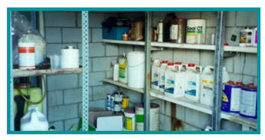
Figure 8. Chemicals must be stored in a well lit, sound and secure structure, with only authorised people allowed access.

Do not store chemicals with chlorine or fertilisers containing ammonium nitrate, potassium nitrate or sodium nitrate as spillage may cause explosions.