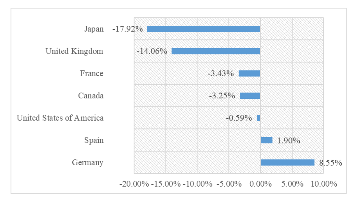
Figure Error! No text of specified style in document.-3: statistics of Vietnam's reduced exports into its strategic markets in the context of COVID-19.

To narrow down to the impacts of the pandemic on Vietnam's coffee industry as the aim of this assessment, the figure 0-3 below shows that, Vietnam's coffee industry has been seriously impacted by the pandemic when the country's access to its traditional import markets, such as US, UK, France, Spain, Germany and Japan, is almost blocked due to the disconnection of the global coffee supply chain. Statistics in the graph below (figure 0-3) shows that, Vietnam's coffee export to most of its strategic markets are negative in the context of the pandemic. The country is only able to maintain its limited exports to Spain and Germany. This is an example that shows how impactful and devastating the pandemic is on Vietnam's coffee industry.