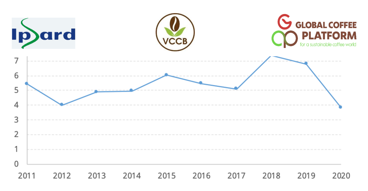
Figure Error! No text of specified style in document.-2: Viet Nam's GDP growth in Q1, year over year, 2011-20