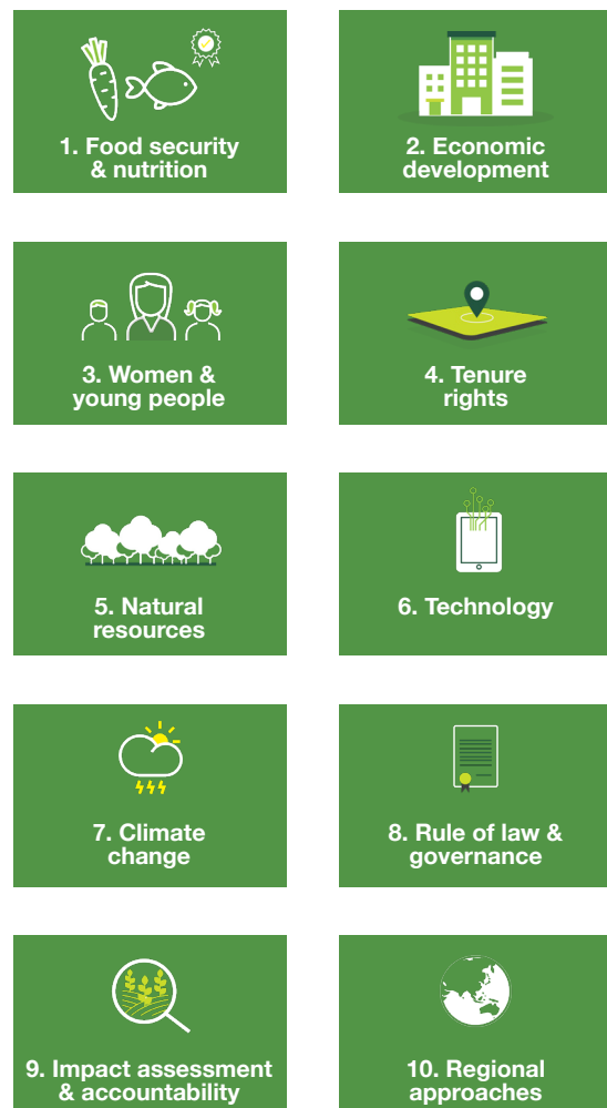
Figure 3. 10 Principles of the ASEAN RAI

The next page outlines the alignment between the company's practices and the ASEAN RAI principles.