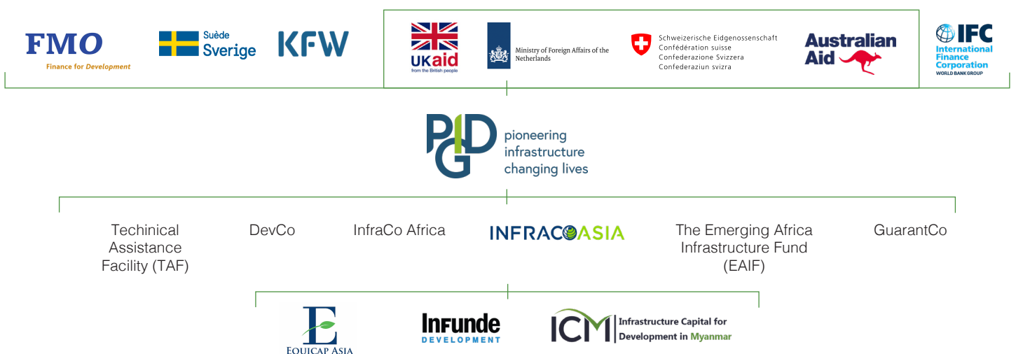
Figure 2. Financing structure of PIDG