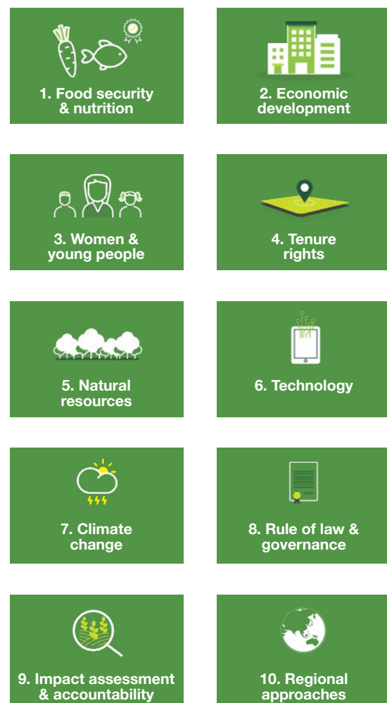
Figure 1. 10 Principles of the ASEAN RAI

This investment retroactively applies the ASEAN RAI to Amru Rice's investment practices and outcomes, which are aligned to (some aspects of) 9 out of 10 Guidelines. If ASEAN RAI had existed before Amru Rice's investment it would have helped them: measure and evaluate the investment's direct impact on food security and nutrition of their farmers (Guideline 1) and integrate additional, targeted climate-smart agriculture practices (Guideline 7).